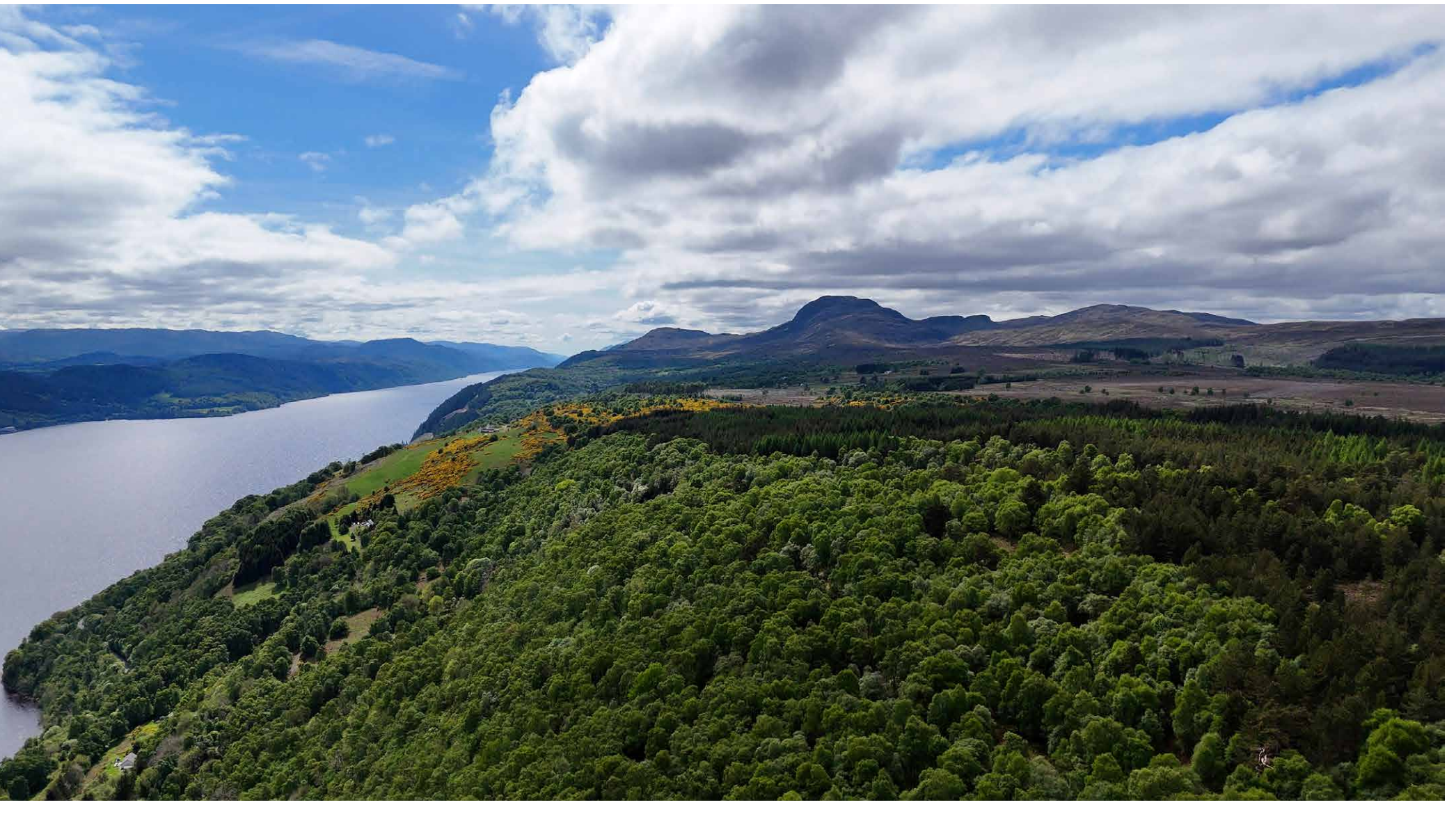
Lot 2 - Borlum Woods & Strone Grazings Approximately 102.95 Ha (254.40 acres) Borlum Wood covers an area of approximately 40 hectares. It was previously a block of productive conifer, planted in 1963 and felled in 2016 by a previous owner.

It was restocked in 2019 before Highlands Rewilding took over management and this planting was carried out with a productive woodland in mind. The area is now a block of even-aged Sitka spruce and Scots pine with naturally regenerating birch throughout, the growth of which has been enabled