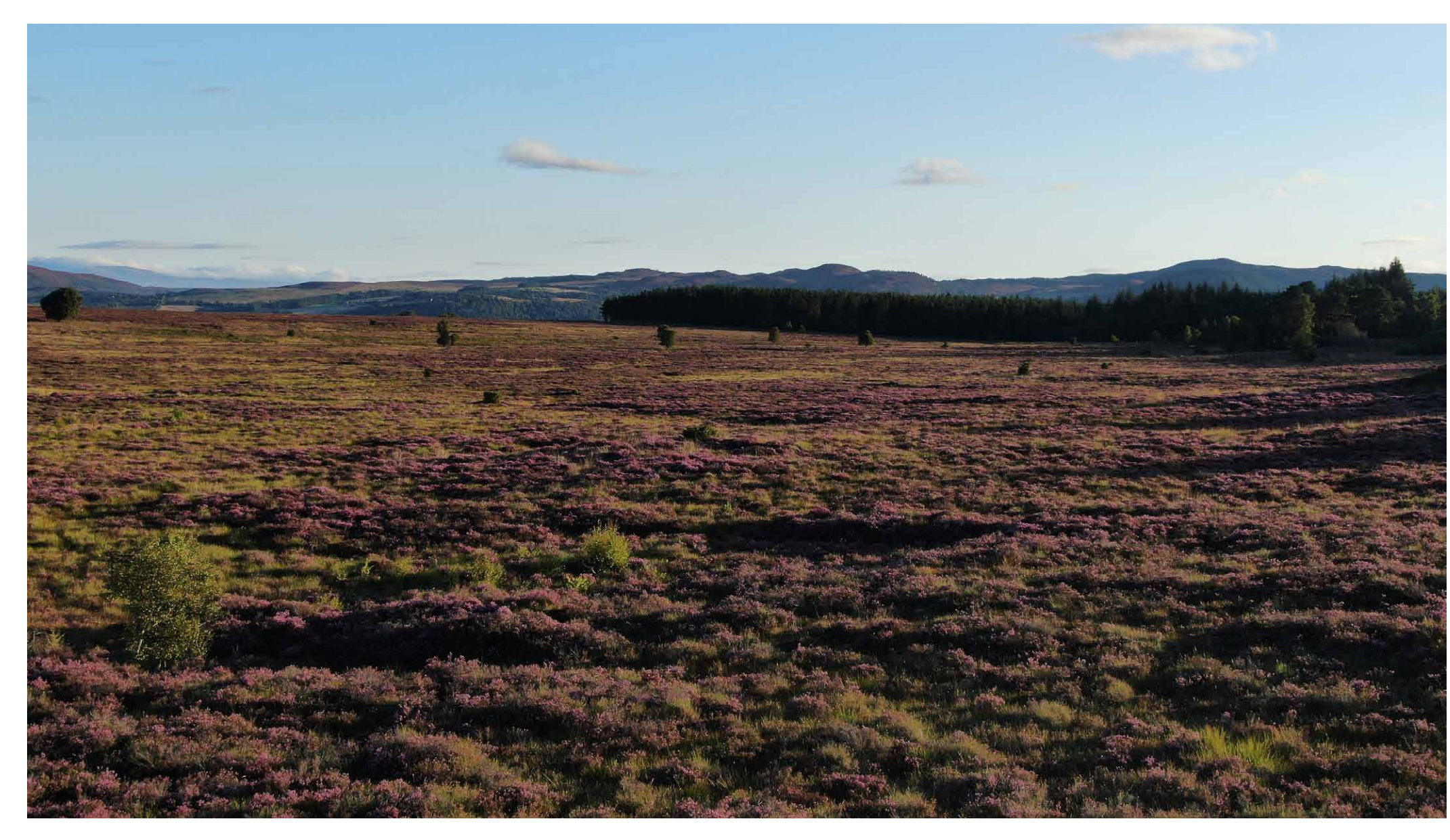
Lot 3 – Upper Lennie woods, Craig Bhallich Woods & Bills Planation Approximately 92.52 Ha (228.63 acres) Lying at the South West portion of the estate this lot comprises an attractive mix of woodland and open spaces which enjoy far reaching views over loch Ness to the

Mondaliath Mountains. This is an attractive lot which lies at the North East of the estate and comprises an attractive mixture of ancient t semi native woodland and conifers as well as some open ground