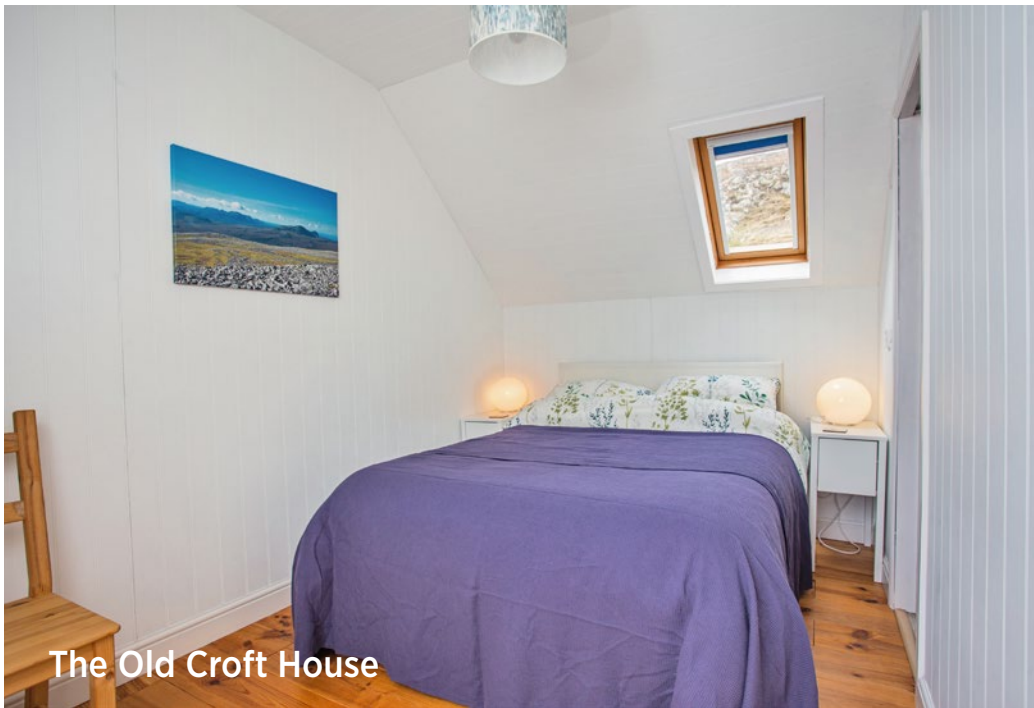
The Old Croft House