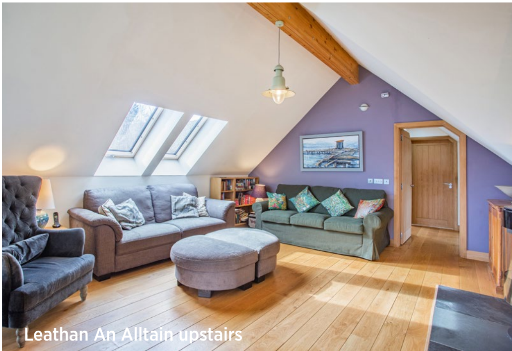
Leathan An Alltain upstairs