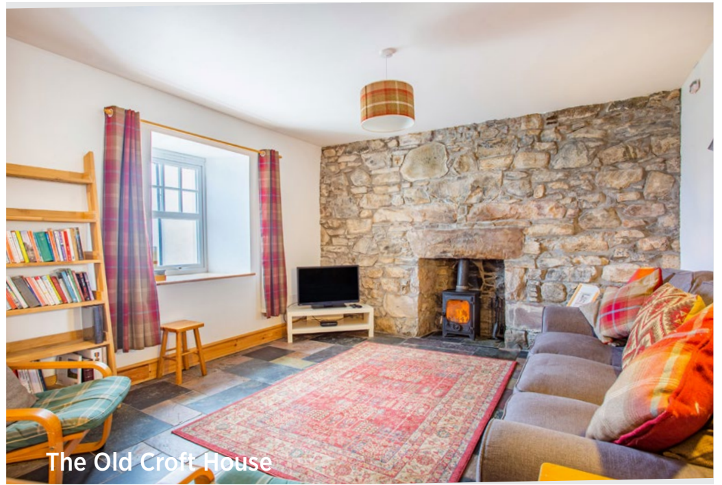
The Old Croft House