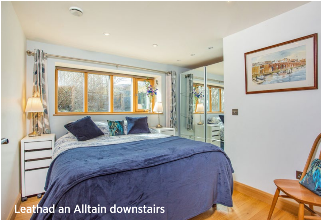
Leathad an Alltain downstairs