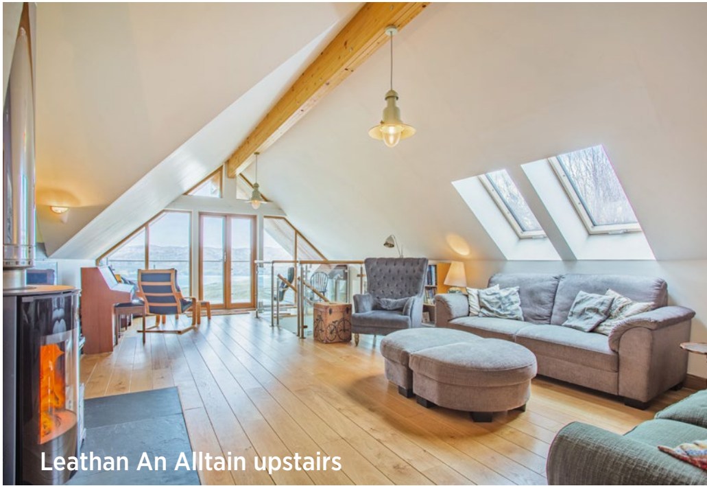
Leathan An Alltain upstairs