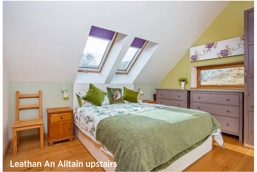
Leathan An Alltain upstairs