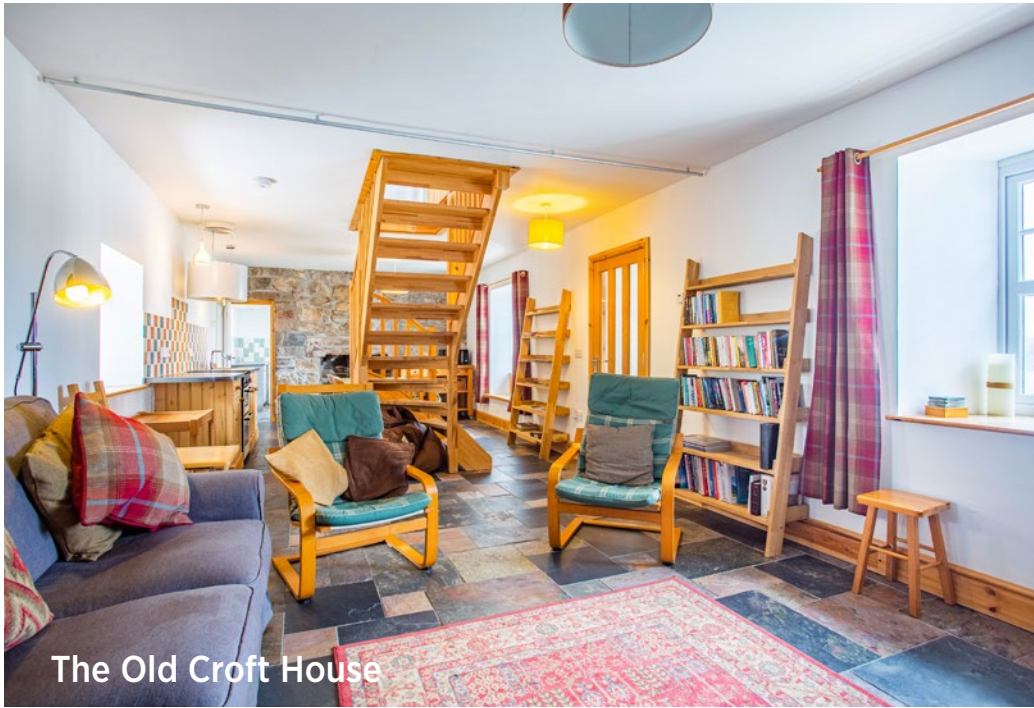
The Old Croft House