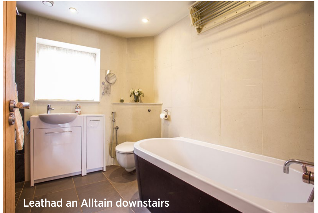
Leathad an Alltain downstairs