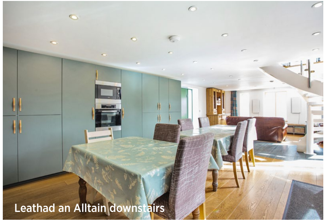
Leathad an Alltain downstairs