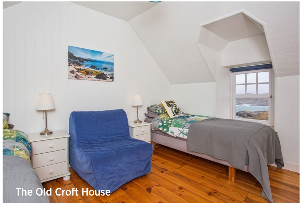
The Old Croft House