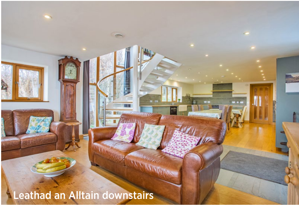
Leathad an Alltain downstairs