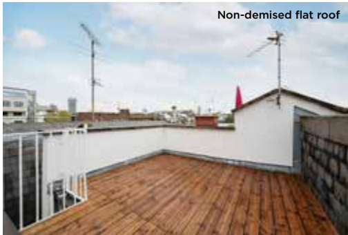
Non-demised flat roof