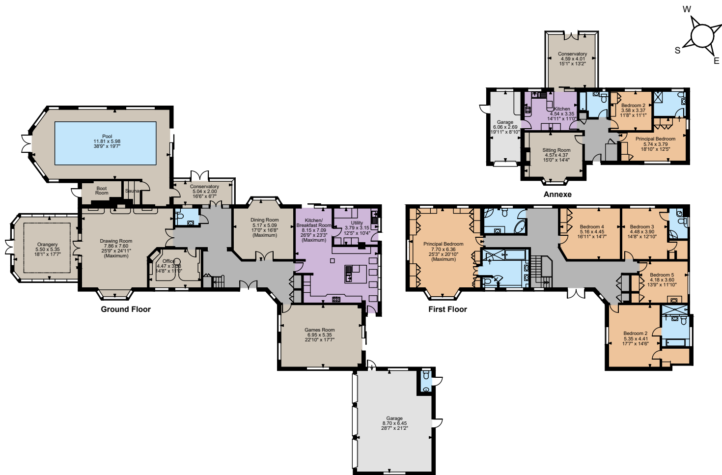
The position & size of doors, windows, appliances and other features are approximate only. © ehouse. Unauthorised reproduction prohibited. Drawing ref. diq/8636275/SS