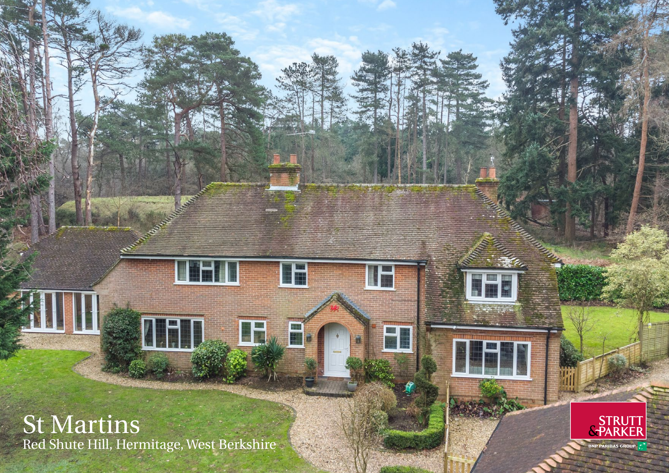
St Martins Red Shute Hill, Hermitage, West Berkshire