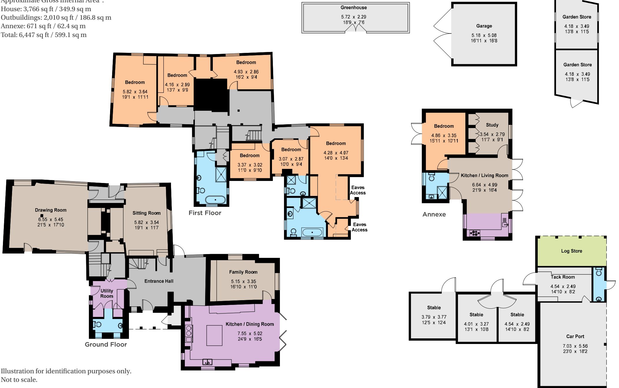
Illustration for identification purposes only. Not to scale.