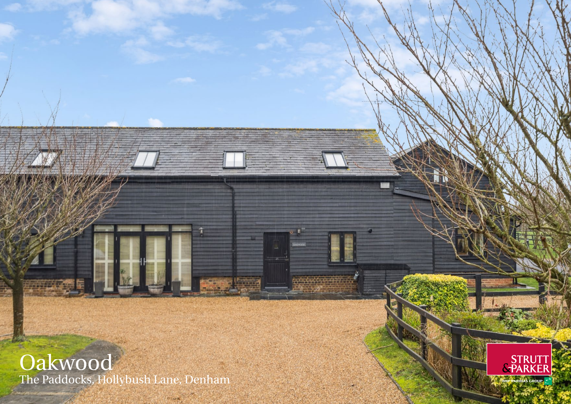
Oakwood The Paddocks, Hollybush Lane, Denham