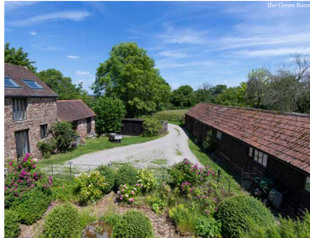
The Green Room

*As defined by RICS – Code of Measuring Practice.