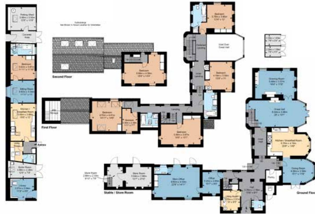
Illustration for identification purposes only. Not to scale.

*As defined by RICS – Code of Measuring Practice.